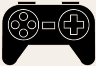
Need for Control