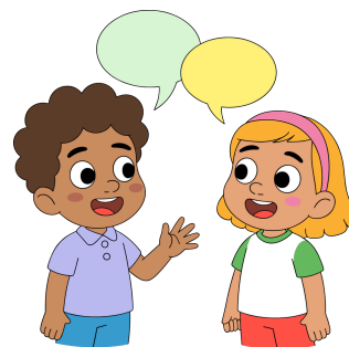
SAYING KIND WORDS

Write or draw your commitment below and brainstorm ways you can live out that commitment in 2026. Parents, refer to it throughout the year, adding new ideas as well as recording celebrations of when they lived out their resolution.