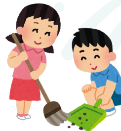
HELPING CLEAN UP